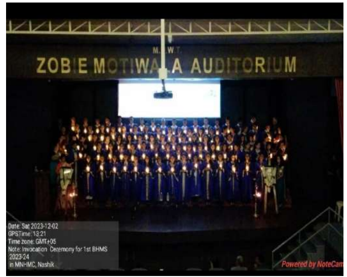
sharing the Light from Teachers