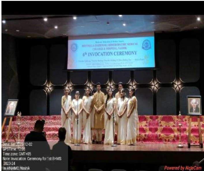
Prayer by a Prayer group