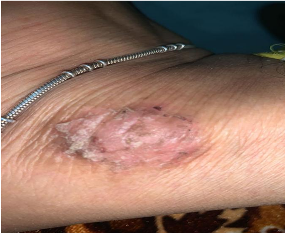
During treatment picture of eczematous eruption on right ankle (1/10/23)